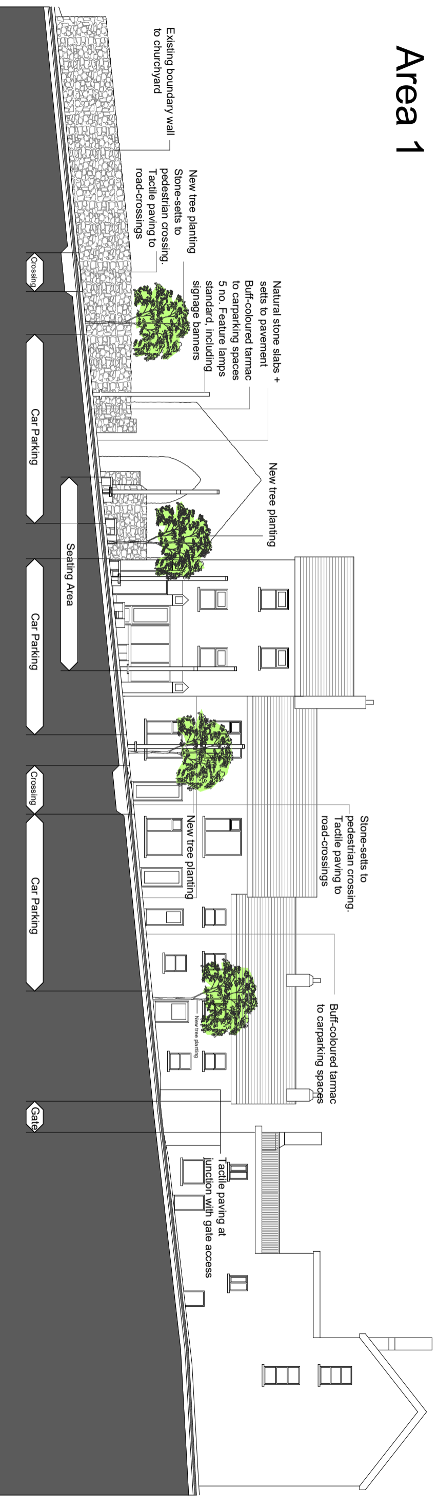
PROPOSED SECTION THROUGH THE OLD CHURCH ROAD / THE BIG BRAE - SECTION A-A