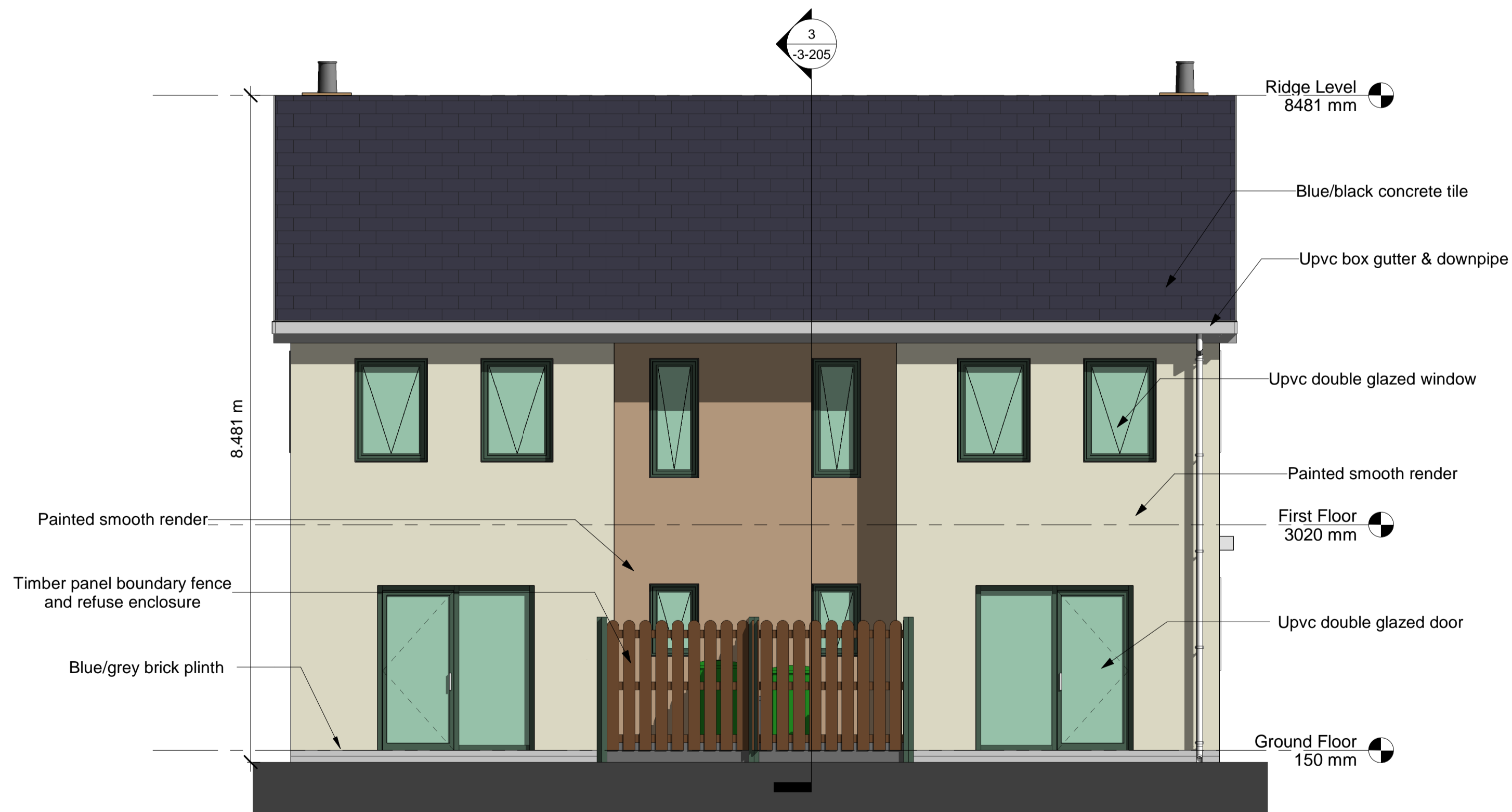
③ Rear Elevation 1 : 50