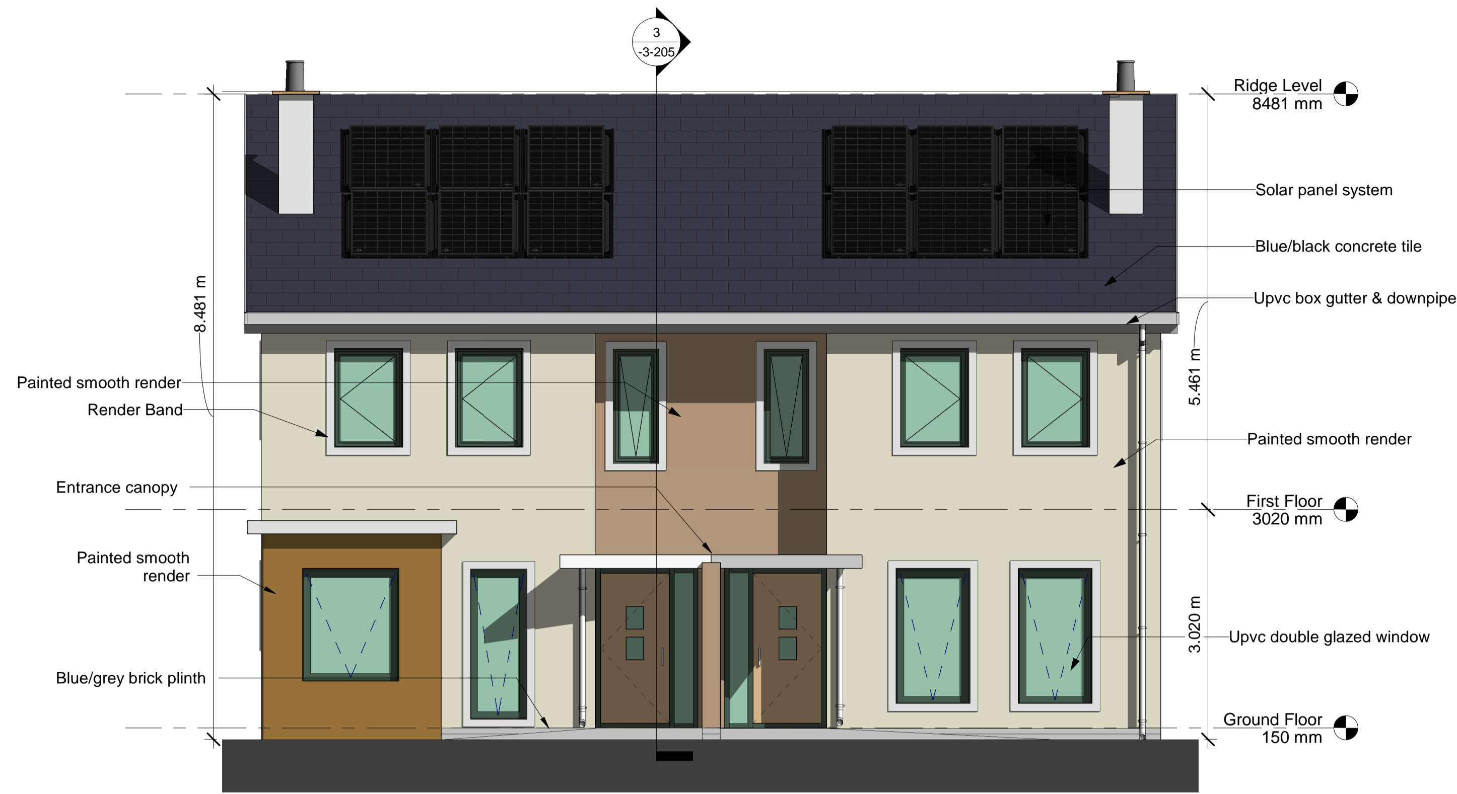
① Front Elevation 1 : 50