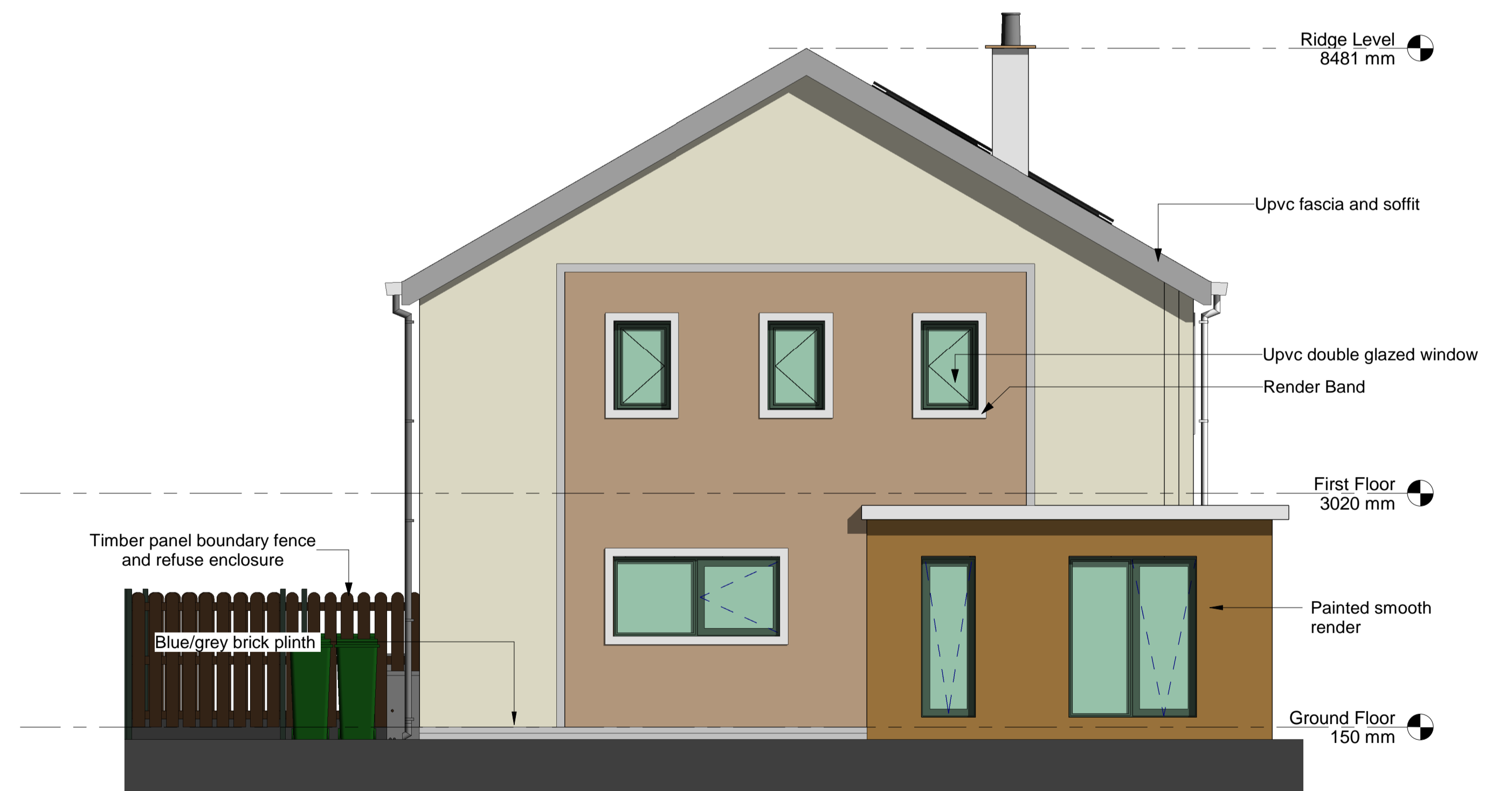
④ Side West Elevation 1 : 50